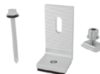
③ XP-MRH-L5D For Steel purlin